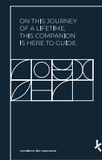
01 Companion Guide